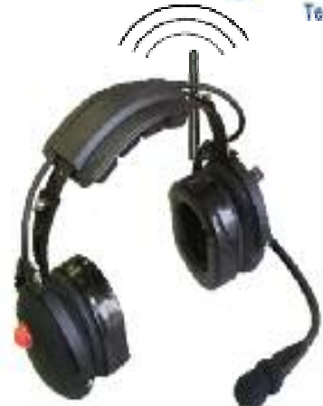
Over-the-Head Style w/ External Antenna T-61530-30-E