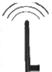
External Antenna T-61531-E