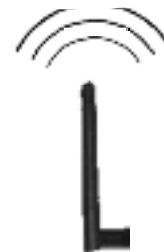
Headset External Antenna T-61530-E