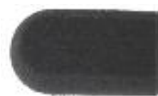
High Wind Mic Muff T-5813