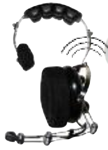
Single Earcup Headset w/ Internal Antenna T-61530-10SD