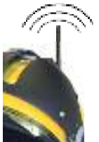
Helmet Remote External Antenna T-61533-EA