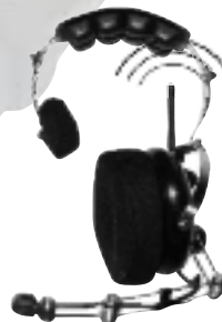
Single Earcup Headset w/ External Antenna T-61530-10SD-E