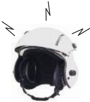
GENTEX Helmets T-61533-GEN

Auxiliary Communication Plug-in Cord (straight or Coiled) (Sold Separately) T-5160-120-3 3' Straight T-5160-120-3CC 3' Coiled