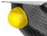
Yellow Microphone on/off Button T-61530-M