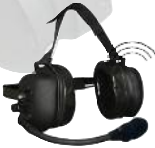
Behind-the-Head Style w/ Internal Antenna T-61530-10