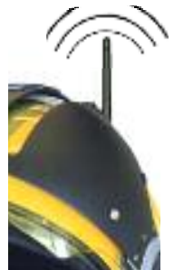
Helmet Remote External Antenna T-61533-EA