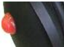
Red Intercom Radio PTT Button T-61530-P