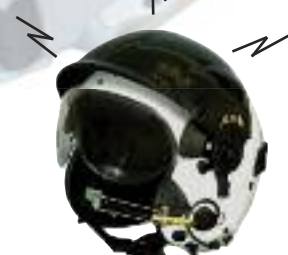
ALPHA Helmets T-61533-ALP