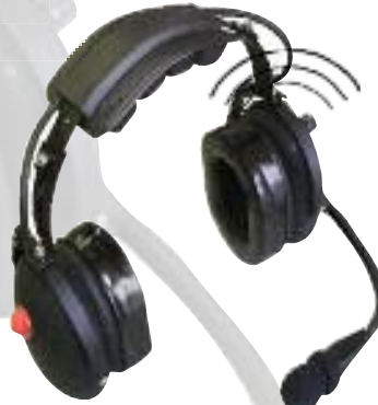
Over-the-Head Style w/ Internal Antenna T-61530-30