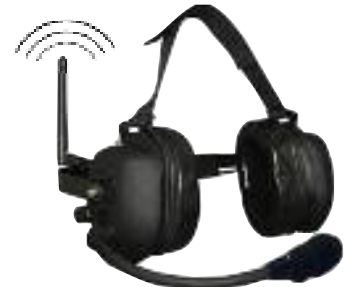
Behind-the-Head Style w/ External Antenna T-61530-10-E

*Each Headset requires it's own mating Lithium Ion battery powered or 110 or 220 volt transceiver