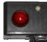
Red Intercom Radio PTT Button T-61531-P