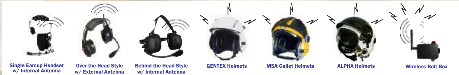
Single Earcup Headset w/ Internal Antenna