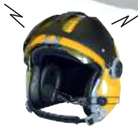
MSA Gallet LH250 Helmet w/wire boom mic T-61533-MSA