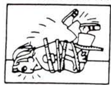
DON'T measure yourself. Measurements are never accurate