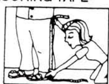
DO have someone else measure you.