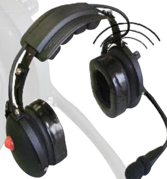
Over-the-Head Style w/ Internal Antenna T-61530-30