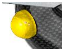
Yellow Microphone on/off Button T-61530-M