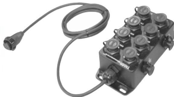
Master Junction Box available in 2, 4, 6 or 8 Person Configuration (8 person shown) T-61502-2/4/6 or 8