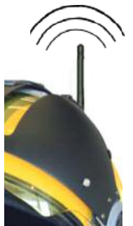
Helmet Remote External Antenna T-61533-EA