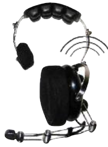
Single Earcup Headset w/ Internal Antenna T-61530-10SD