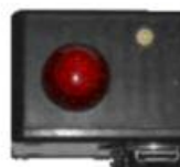
Red Intercom Radio PTT Button T-61531-P