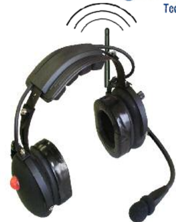
Over-the-Head Style w/ External Antenna T-61530-30-E