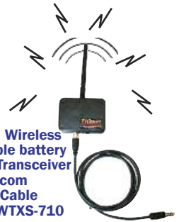
Bluetooth Wireless rechargeable battery powered Transceiver with Intercom Interface Cable T-61530-WTXS-710