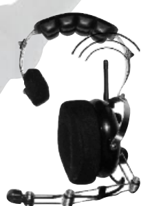
Single Earcup Headset w/ External Antenna T-61530-10SD-E