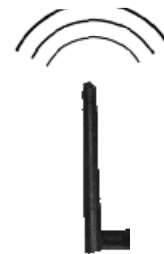
Headset External Antenna T-61530-E