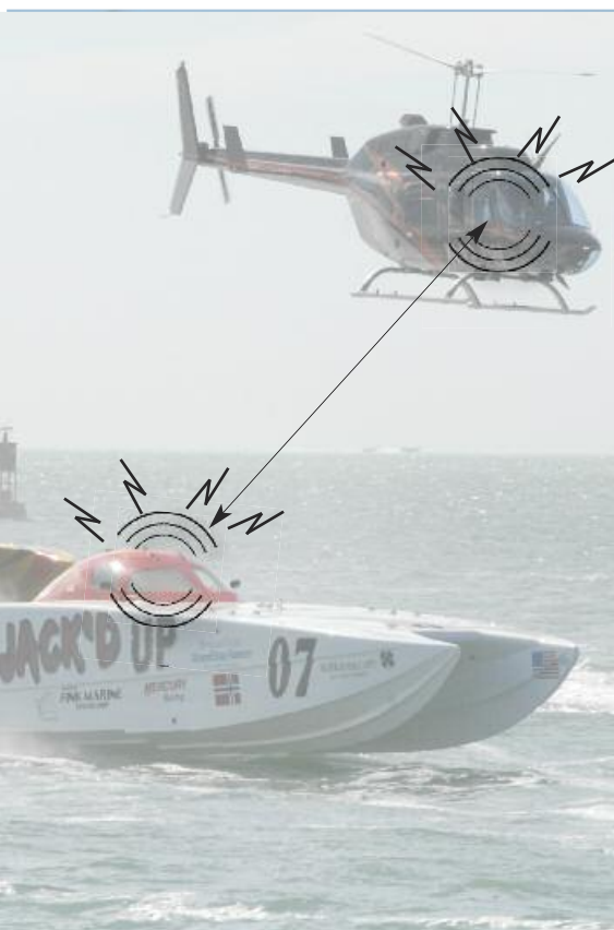
Racing Crew talking to each other and Rescue Helicopter via Bluetooth Wireless Communications.

Double Talk Kits DO NOT REQUIRE Transceivers!