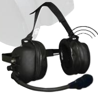
Behind-the-Head Style w/ Internal Antenna T-61530-10