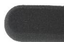
High Wind Mic Muff T-5813