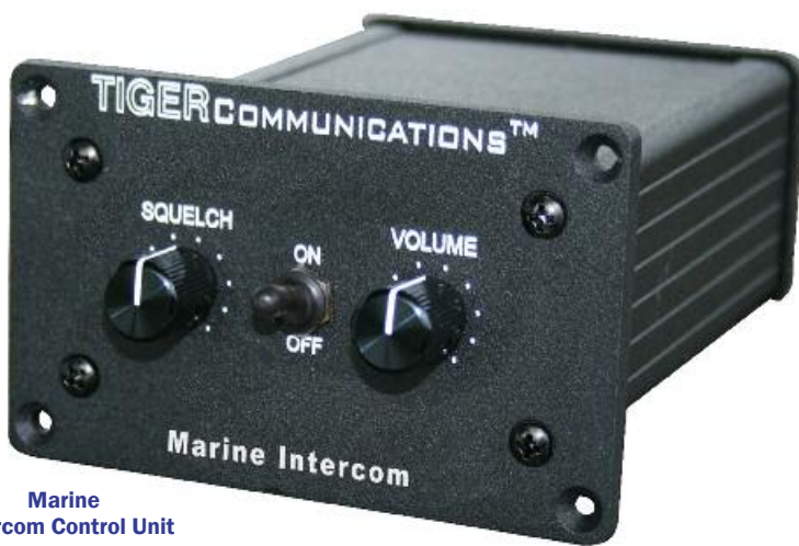
Marine Intercom Control Unit T-6101W