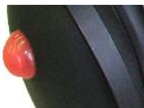
Red Intercom Radio PTT Button T-61530-P