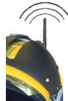
Helmet Remote External Antenna T-61533-EA