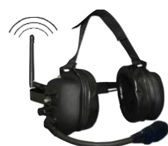
Behind-the-Head Style w/ External Antenna T-61530-10-E

*Each Headset requires it's own mating Lithium Ion battery powered or 110 or 220 volt transceiver