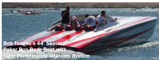
Bob Teague's 44' Skater Poker Run Race Boat with Tiger Performance Intercom System

"I choose Tiger Performance for all my Racing and High Performance Communication Equipment. The Tiger Intercom Systems offers the best sound quality and more features than any other Stereo Intercom System on the market."