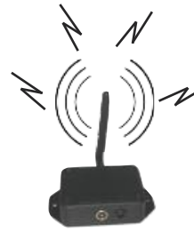
Bluetooth Wireless 7-24 Volt Transceiver T-61530-WTX-710

T-61530-YIPC Waterproof Tiger Intercom to Wireless Transceiver & Radio P.T.T. Interface "Splitter" Cable Assembly available in 2', 5', 10' & 15' lengths