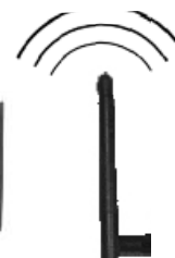
External Antenna T-61531-E