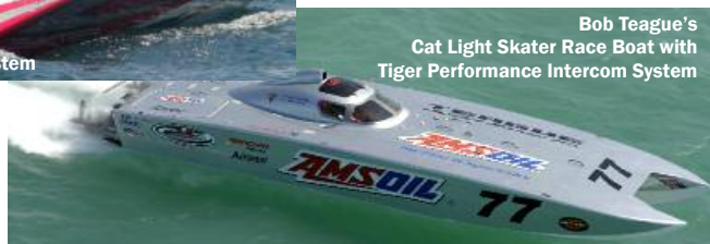
Bob Teague's Cat Light Skater Race Boat with Tiger Performance Intercom System

"I choose Tiger Performance for all my Racing and High Performance Communication Equipment. The Tiger Intercom Systems offers the best sound quality and more features than any other Stereo Intercom System on the market."